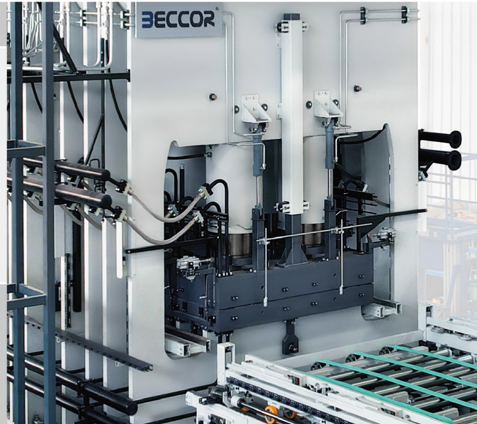
Professional Manufacturer of Press Machine Lines